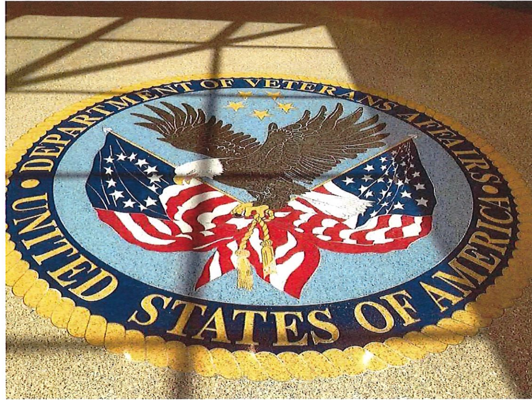
A LOBBY - TERRAZZO EPOXY FLOOR DESIGN