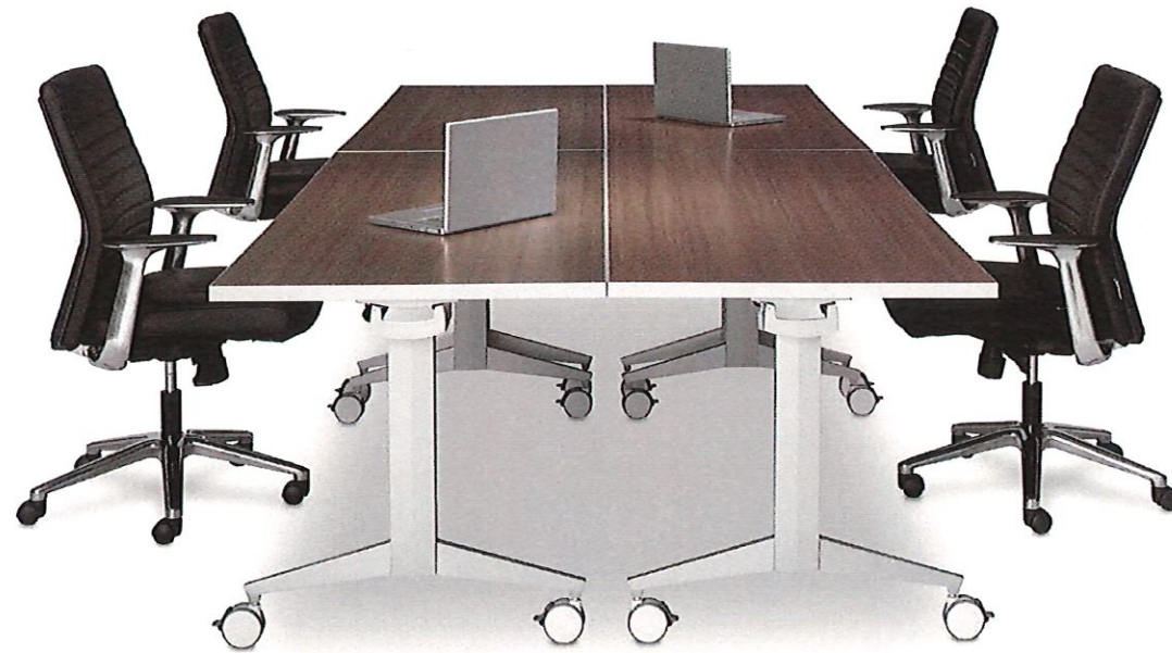
B UTILITY AND ZONING SHARED SPACE - RECONFIGURABLE TRAINING TABLES